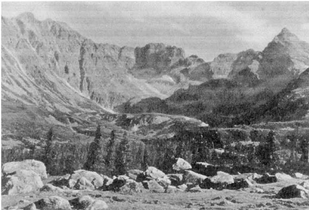
Dr. Le Bon was the first Frenchman to visit the Tatras mountains region.