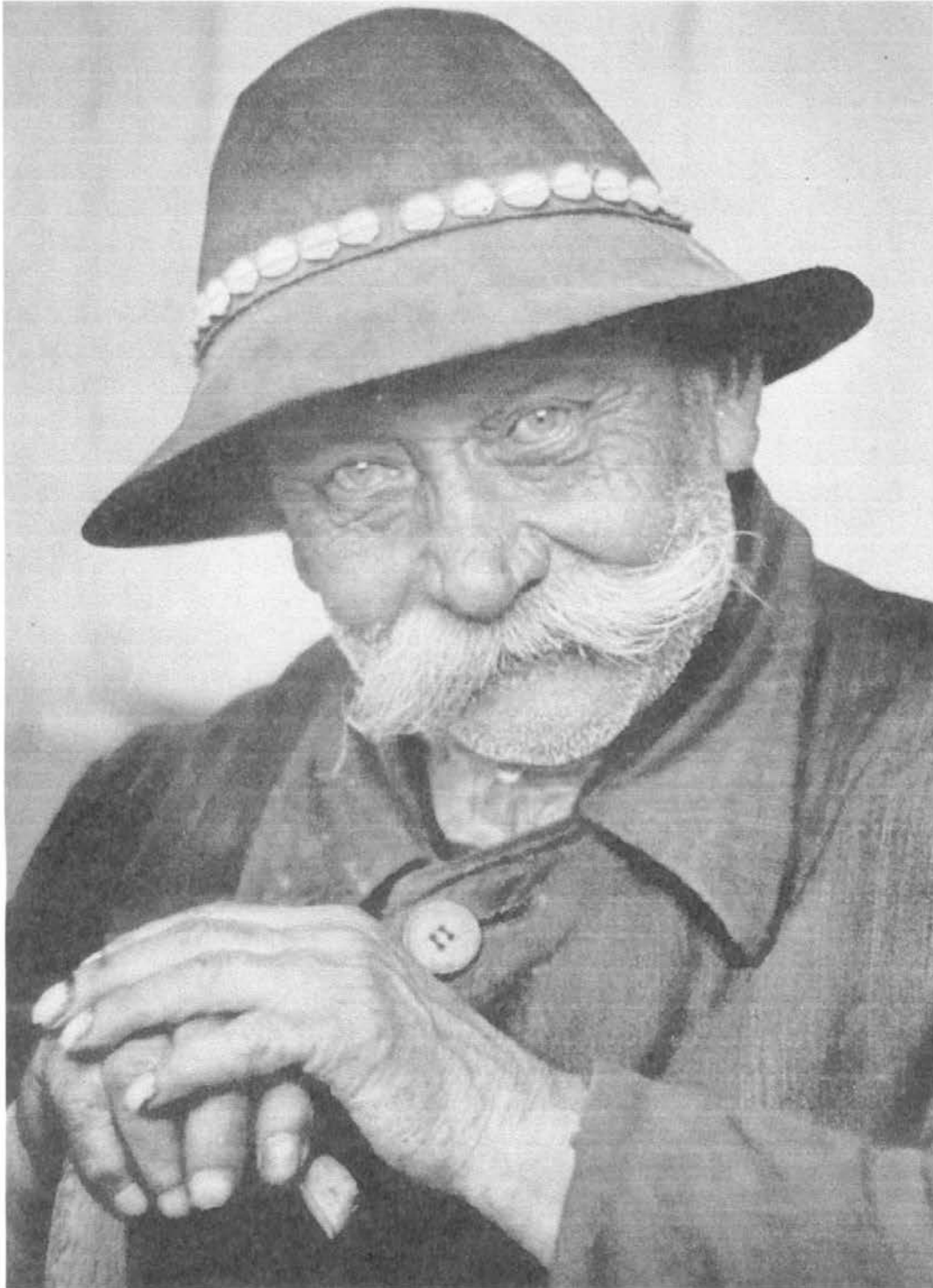
70% of the Podhaleans have blue eyes, 42% of them large heads; both of these characteristics are present in this elderly resident of Zakopane.