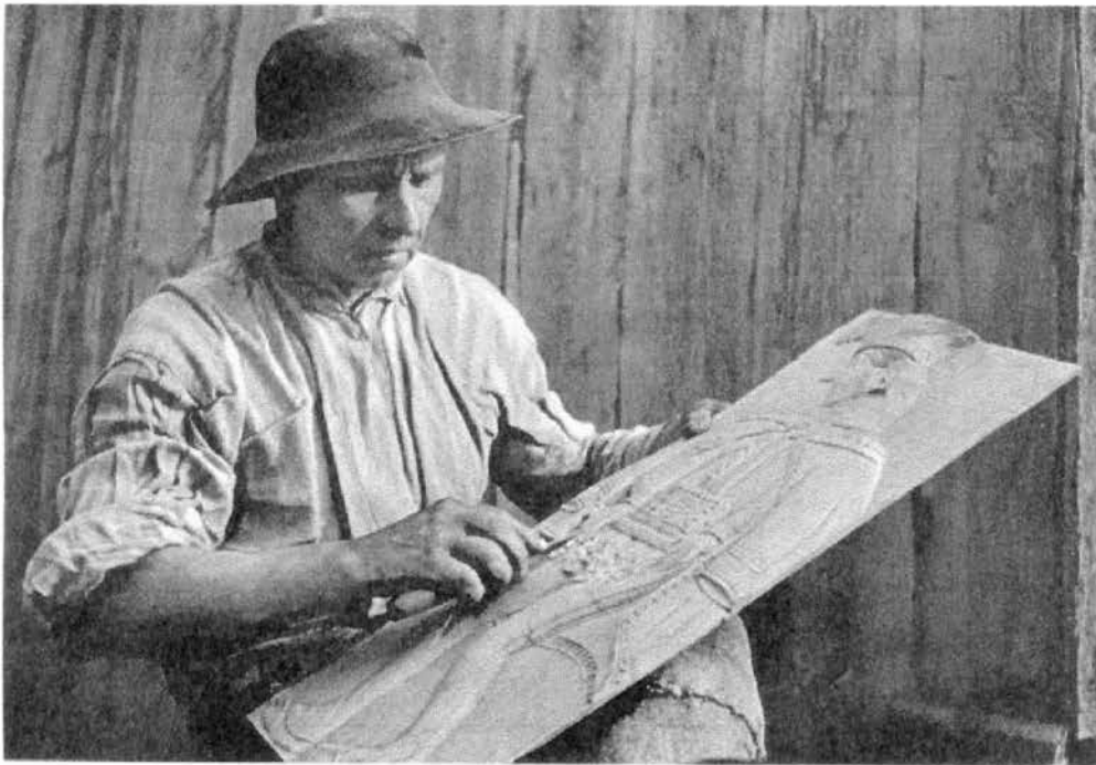
By their lively intelligence, their musical, artistic, and literary aptitudes, the people of the Tatras mountains clearly distinguish themselves from their neighbors. Wood carver (bottom) is creating the image of Janosik, the brigand hero of the Podhaleans.