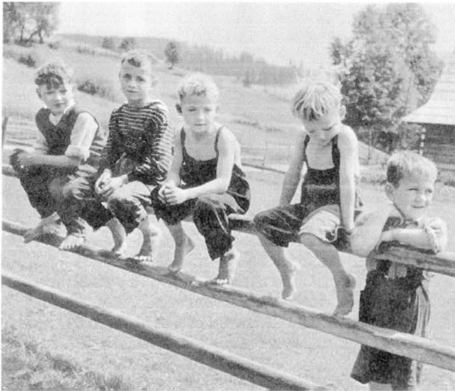
66% of the population of the Tatras mountains possess blond or auburn hair, as is evident in these Podhalean children.